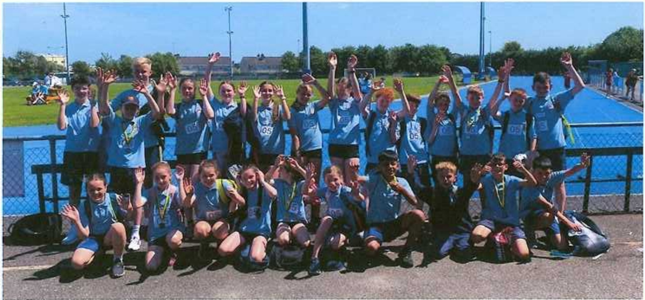
Congratulations to all our athletics in competed in Claremont Stadium recently.