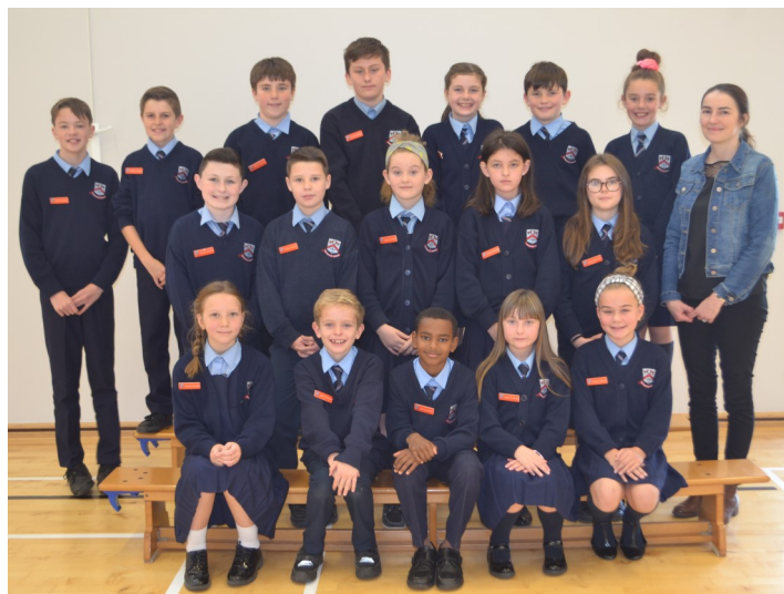
Our Library Committee