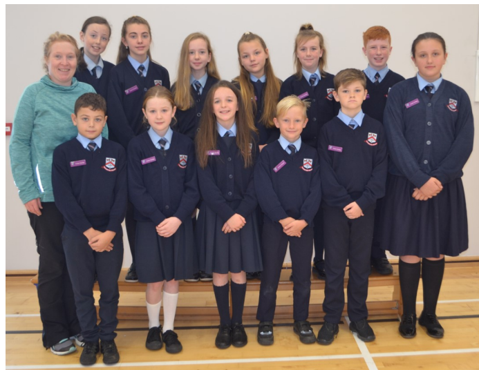
Our Coiste Gaelige