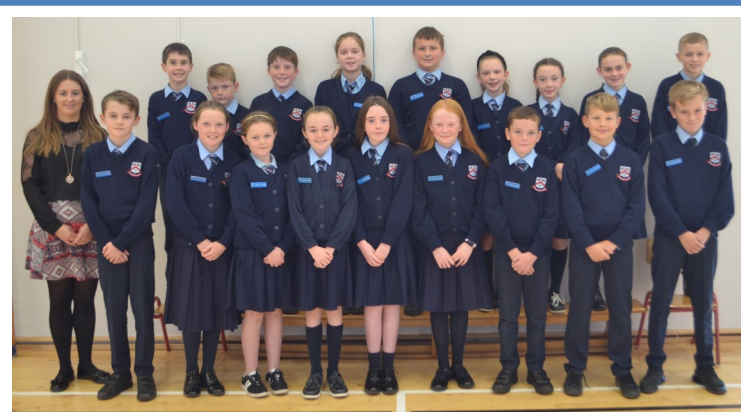
Introducing our Active Committee