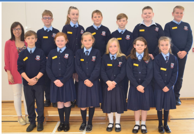
Meet our Garden Committee