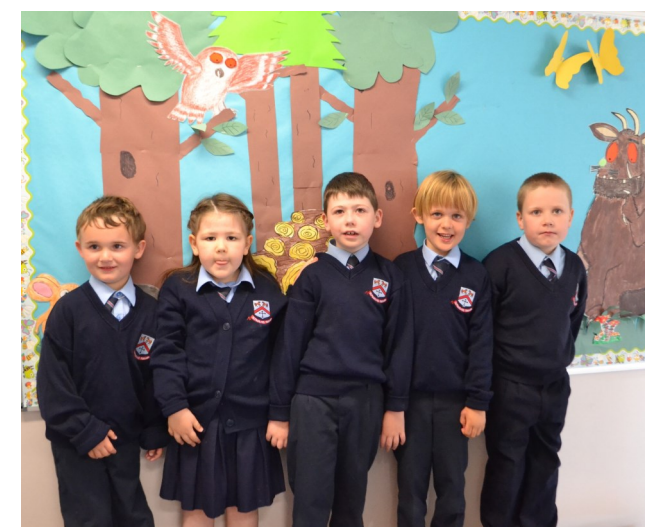
Children from Room 26 presenting their Gruffalo Work!

Back to School on Thursday 31st August Confirmation 2018 — Friday 13th April at 3pm Communion 2018 — 19th May