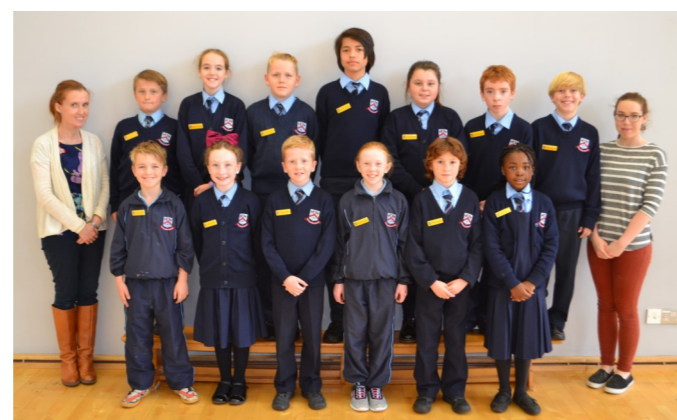
Meet our Garden Committee