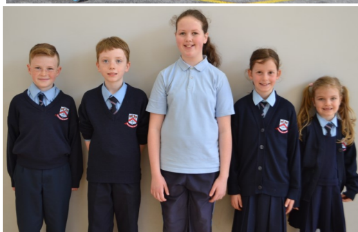
Green School Scooter Day