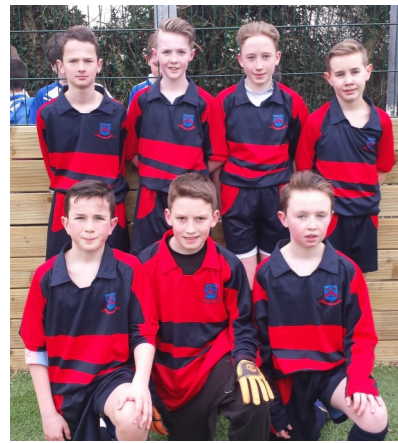
Boys' and Girls' Soccer Teams