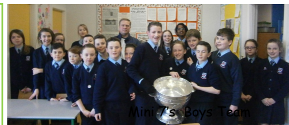
Mini 7's Boys Team