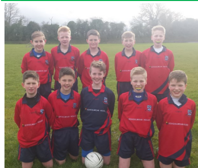
Mini 7's Boys Gaelic Team