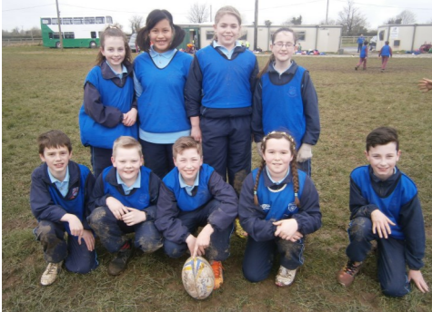
Some of our 5th Class Children at the Rugby Blitz day