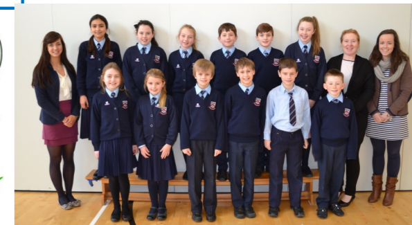
Coiste na Gaeilge