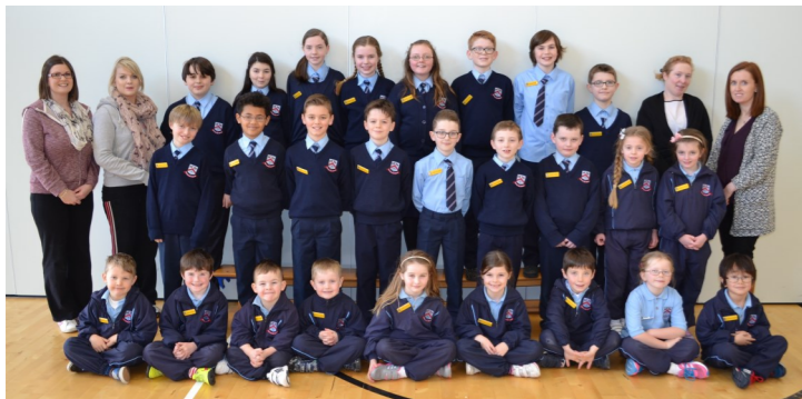
Meet our Garden Committee