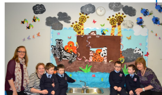
Noah's Ark—artwork created by Room 26

Thank you to our PA who funded a visit from Tayto Parks Wildlife on Wheels over a two day period where children from 1st class up were given a talk and then given an opportunity to interact with some of the animals.