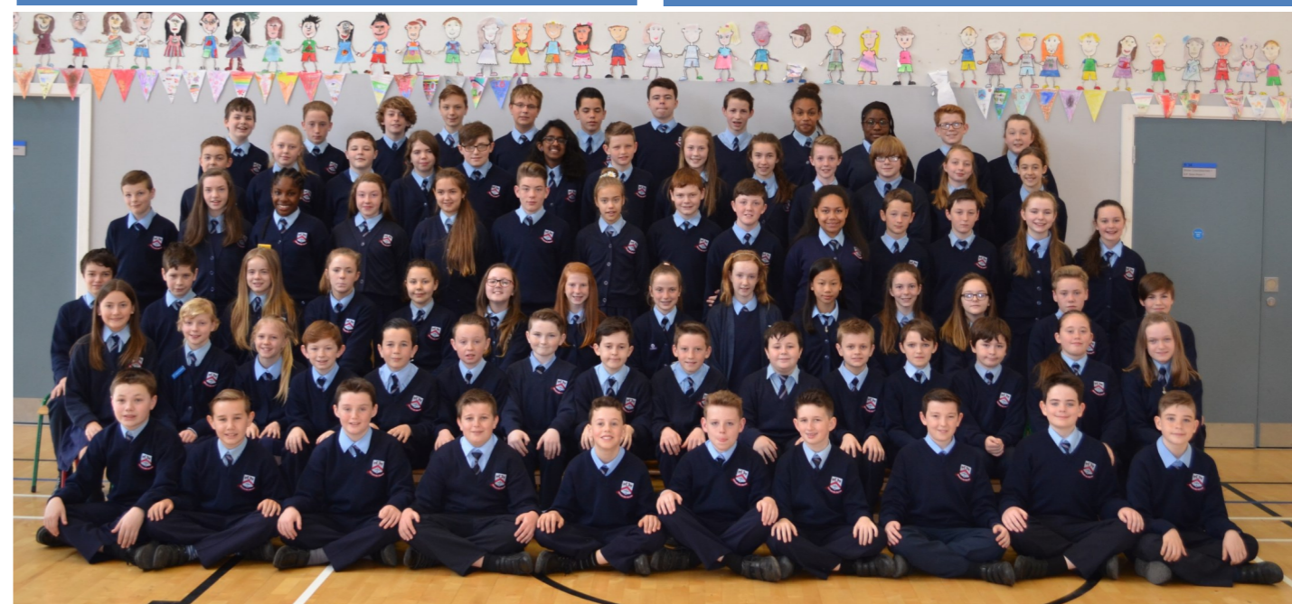
Classes of 2016 Graduate