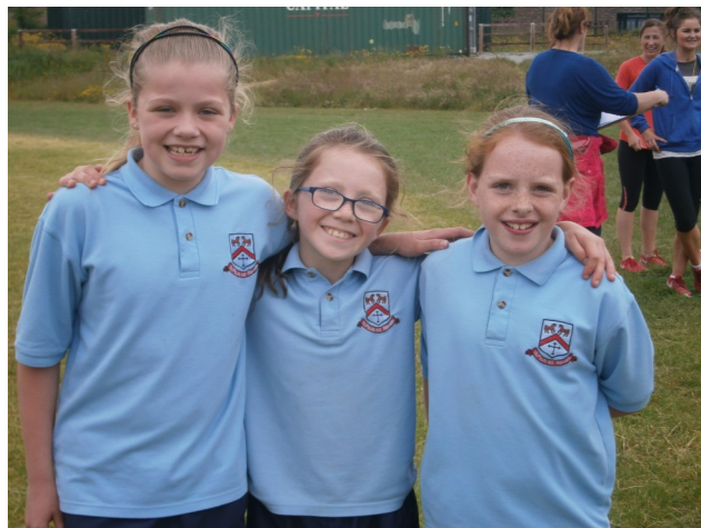
Enjoying Athletics Day as part of Active week!