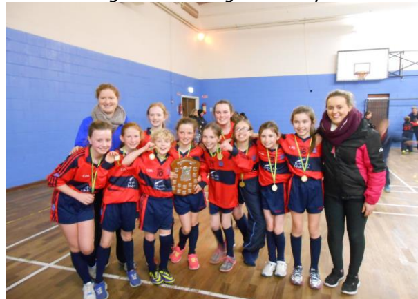
U/11 Girls Olympic Handball Meath Champions

St. Paul's had four teams, two girls and two boys participate in the Olympic Handball Meath Championships on the 27 th March. All teams played brilliantly and the Girls were crowned Champions U/11 and U/13. They both progress to the Leinster Finals. The boys were unlucky with the U/13 boys coming 2nd! There is always next year! Thank you to all the teachers involved for all their hard work and encouragement throughout the year!!