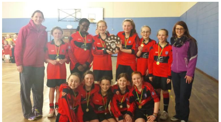
U/13 Girls Olympic Handball Meath Champions