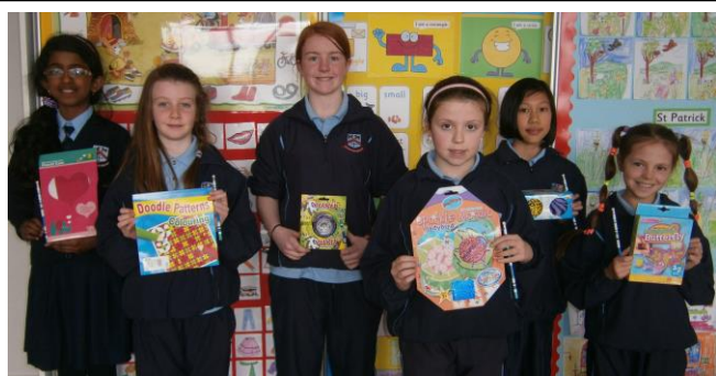
Our Green Schools Poster Winners